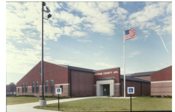
Putnam County Jail

OMS designed a new one story county correctional facility that consists of 48 cells with a 20-bed dormitory and includes full services facilities for the Putnam County Sheriff's Department . This facility was privately financed as a lease-to-own, turn-key project