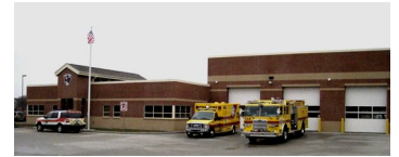
Pike Township Fire Station 114

Replacing a 1950's building, Fire Station 114 is a new station of 12,500 square feet for twelve firefighters per shift. The station features a watch office, two private offices, twelve individual bunk rooms, kitchen, dining room, small and large television lounges, an exercise room, and locker rooms/showers. Three apparatus bays are provided for two fire trucks and an ambulance with overhead doors on the front and back for drive-through access. The apparatus bay includes ancillary space for turnout gear storage, EMS storage, clean room and a storage mezzanine. The facility is protected throughout with a fire alarm system and a wet-pipe sprinkler system. A natural gas generator provides back-up electrical service to