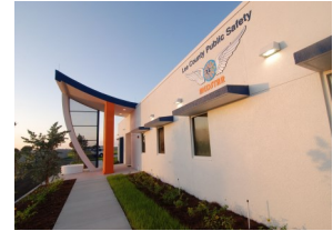
Lee County EMS Hanger

OMS designed a 15,000 square foot EMS facility to house two Medstar helicopters, two ambulances and support facilities. The hanger now serves as the emergency command center in the event of severe storms. The facility is designed to withstand 180 mph winds and includes emergency generators to maintain the entire facility for extended periods. The building also contains crew quarters, training rooms, conference area, kitchen and dispatch room.