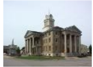
DuBois County Courthouse

This classic renaissance style building with Ionic Columns and four entrances was completed in 1911. The DuBois County Courthouse underwent a complete renovation/restoration under OMS's direction. The courtrooms, administrative and community spaces each received new finishes including some new custom millwork designed to match the original woodwork and cabinetry, new technology upgrades were also included in the renovation.