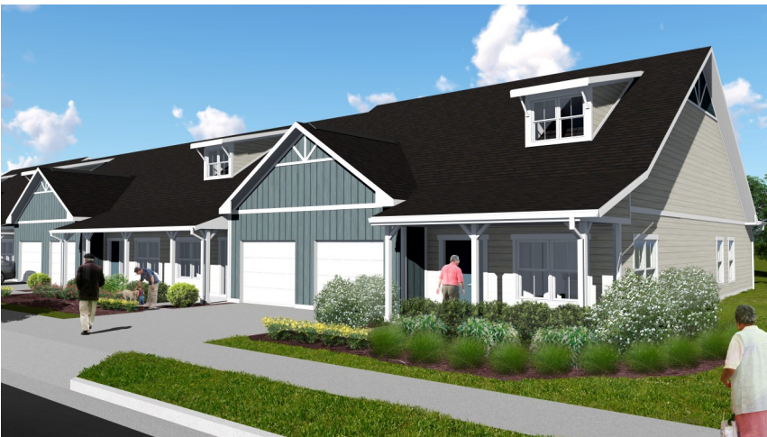
Hunter Station Garden Homes

The independent living Garden Homes offer fully equipped kitchens, sunrooms and landscaped yards all on one level. These residences are located on the Traditions at Hunter Station campus with easy access to the main building which features casual and fine dining, chapel, movies theater salon and fitness center. The Garden Homes on this project truly reflect the Farm House style with their lap and batten and board siding, gabled elements and front porches all contributing to the pastoral image.