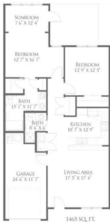
Two Bed/Two Bath Garden Home