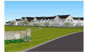
Traditions at Hunter Station

ARCHITECTURE INTERIOR DESIGN LANDSCAPE ARCHITECTURE ENGINEERING