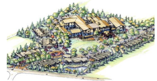
Traditions at Beaumont

Odle McGuire Shook ARCHITECTURE INTERIOR DESIGN LANDSCAPE ARCHITECTURE ENGINEERING