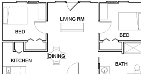
Two Bedroom Unit