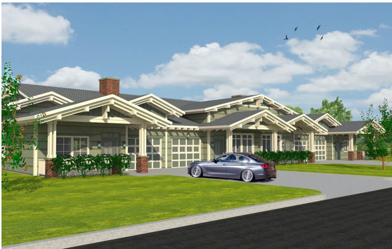
Garden Home Entrance

This eight-fourplex complex is located within the Traditions of Beaumont campus. Complimenting the assisted living facility, these garden homes are also designed in the Arts and Crafts style with wide overhanging porches at the entry and exterior features of brick and lap siding in inviting, warm natural tones. The garden home concept accommodate independent senior living with access to all of the amenities, including food service, of the assisted living facility.