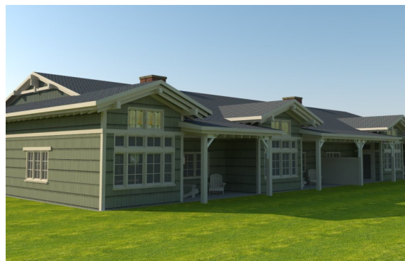
Garden Home Back View