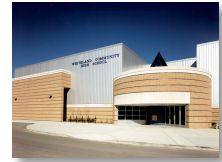
Whiteland High School

ARCHITECTURE INTERIOR DESIGN LANDSCAPE ARCHITECTURE ENGINEERING