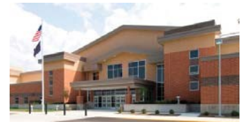
Noblesville West Middle School

ARCHITECTURE INTERIOR DESIGN LANDSCAPE ARCHITECTURE ENGINEERING