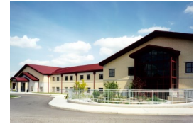
Cloverdale Middle School

Odle McGuire Shook ARCHITECTURE INTERIOR DESIGN LANDSCAPE ARCHITECTURE ENGINEERING