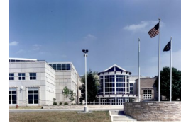
Bloomington South High School

Odle McGuire Shook ARCHITECTURE INTERIOR DESIGN LANDSCAPE ARCHITECTURE ENGINEERING