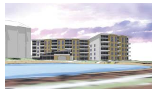
Beach Front Property