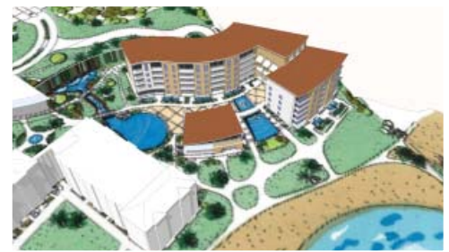
New Fractional Area