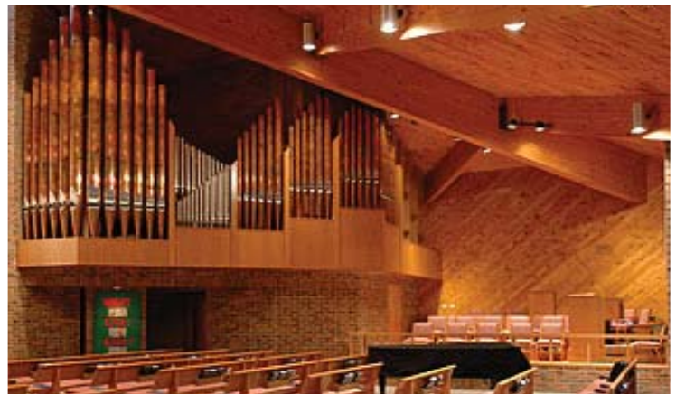
Pipe Organ in Sanctuary